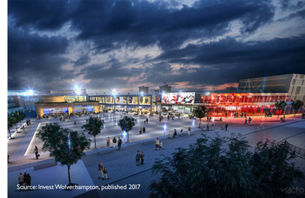
published 2017