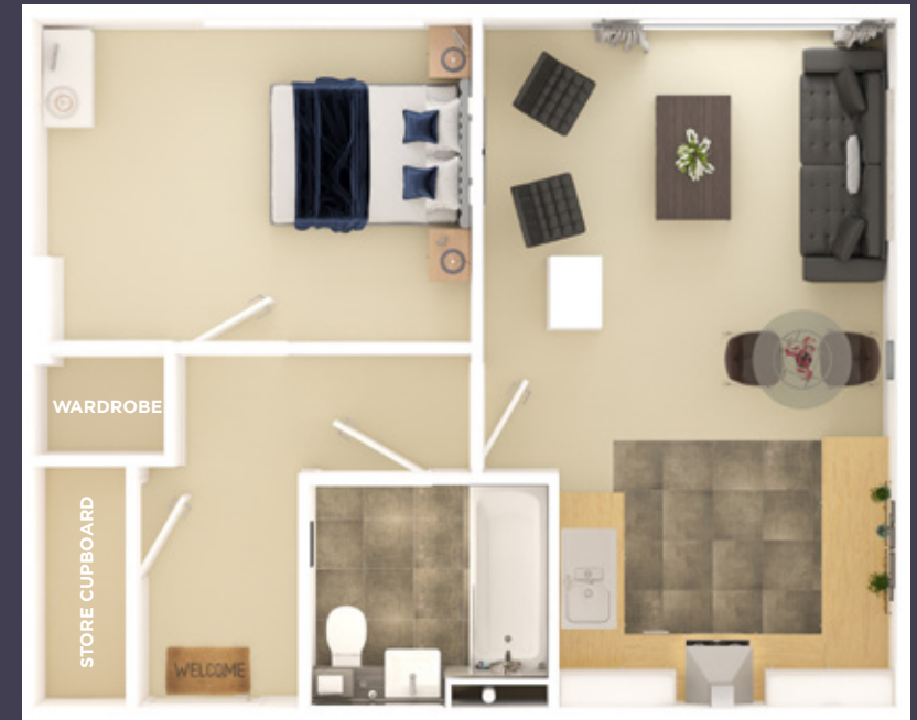
Indicative one bedroom apartment