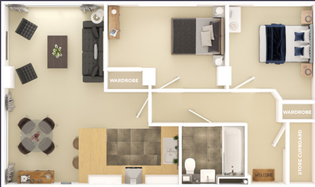
Indicative two bedroom apartment